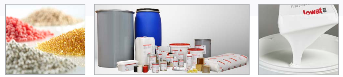
The information given in this leaflet is based on test results from our laboratories as well as on experience gained in the field, and does in no way constitute any guarantee of properties. Due to the wide range of different applications, substrates, and processing methods beyond our control, no liability may be derived from these indications nor from the information provided by our free technical advisory service. Before processing, please request the corresponding data sheet and observe the information in it! Customer trials under everyday conditions, testing for suitability at normal processing conditions, and appropriate fit-for-purpose testing are absolutely necessary. For the specifications as well as further information, please refer to the latest technical data sheets.

Jowal Subsidiaries Distribution Partners